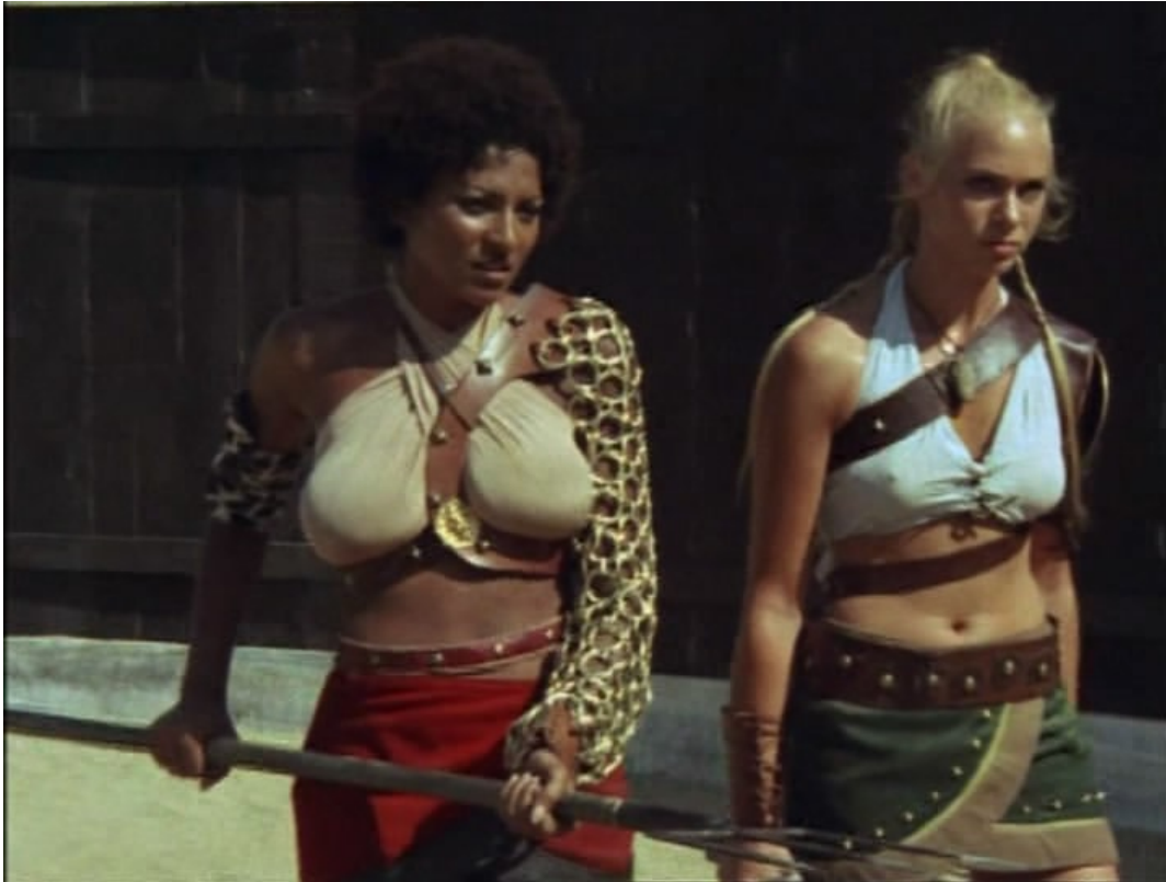
Figure 3 Gladiatrices Mamawi (Pam Grier) and Boudica (Margaret Markov), in the movie The Arena (1974).