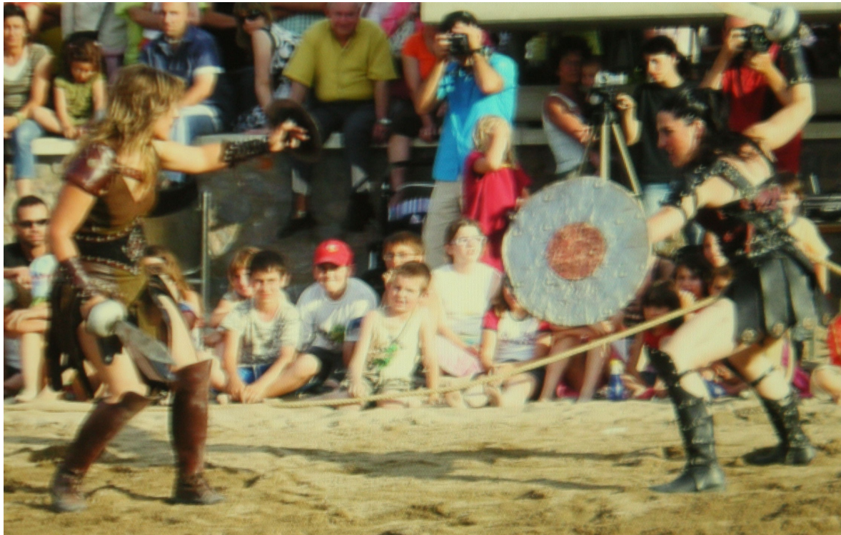
Figure 1 Two overseas re-enactors fighting as gladiatrices, sword and shield (right) against sword and buckler (left).