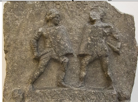
Table 1 Historical depictions of gladiatrices

This marble relief from Halicarnassus in Turkey dates from the second century AD and resides in the British Museum. It depicts two women, Amazon and Achillia, fighting as gladiatrices. The Greek inscription declares them missae sunt , that they both have received missio and been granted a reprieve from this particular contest (both had been deemed to have won).